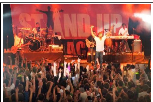
Stand Up concert with Reggae star Patrice in Bonn, Germany – 1,500 fans standing up against poverty on Oct. 18th 2009