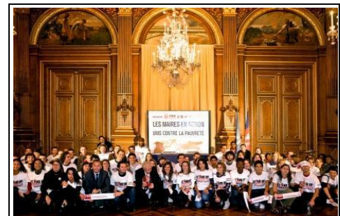
The Stand Up seal initiative commemorating the signature of a strategic partnership between the Campaign and Paris City Hall on October 16 th 2009.

As a result of the aforementioned initiatives, key partners and various influential actors have committed their support to the Campaign. As part of the Stand Up mobilization, 4,000 roller skaters participated in a colorful parade along the streets of Paris. Etudiants et développement, an umbrella organization of student NGOs, organized local Stand Up events in Strasbourg, Toulouse and other French cities. Furthermore, the city of Paris was awarded the seal of "MDG Committed City" during a ceremony with more than 100 citizens. Finally, with the strategic support of UNDP, an advertisement campaign with football star Zinedene Zidane was released prior to Stand Up 2009. In terms of partnering with media, the Campaign Director continues to serve on the board of the Agence France Press Foundation, contributing substantive inputs to their initiatives in poor countries.