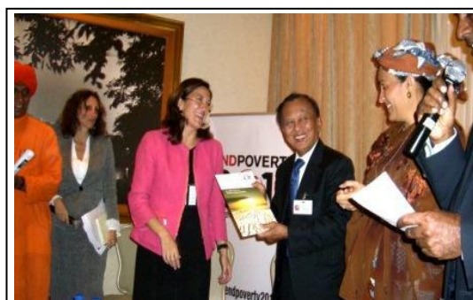
Swmai Agnivesh, Hon. Soraya Rodriguez, Hon. Rachmat Witoelar, & Hon. Amina Ibrahim at the launch of the UN Millennium Campaign publication on Climate Change and the MDGs. Sept. 22, 2009

The Campaign also produced a revised version of its publication on MDGs and Climate Change, calling on all stakeholders to seal a just deal with respect to Climate Change. The revised publication was launched during the one day United Nations High Level Event on Climate Change held in New York on September 22, 2009.