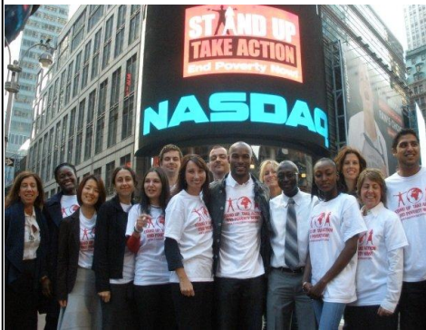
October 20 th opening of the NASDAQ Electronic Stock Exchange with model Tyson Beckford to help commemorate the world record breaking Stand Up achievement. Times Square, NYC

Up's success including: NGOs, faith groups, schools, local organizations, youth and sports groups, the private sector, foundations and the United Nations system.